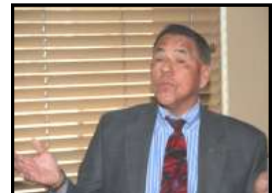
"It's ok, I brought in a replacement Hippo"